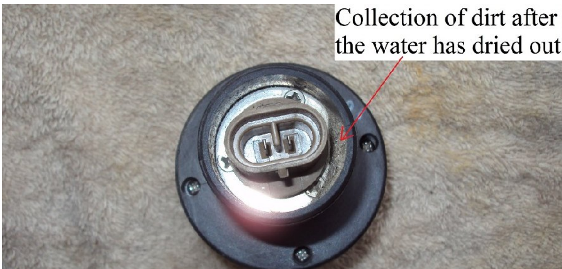
Collection of dirt after the water has dried out