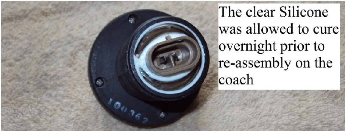
The clear Silicone was allowed to cure overnight prior to re-assembly on the coach

In the future if water/moisture re-enters any assemble or the bulb requires replacement removing the tubing will allow for quick bulb replacement.