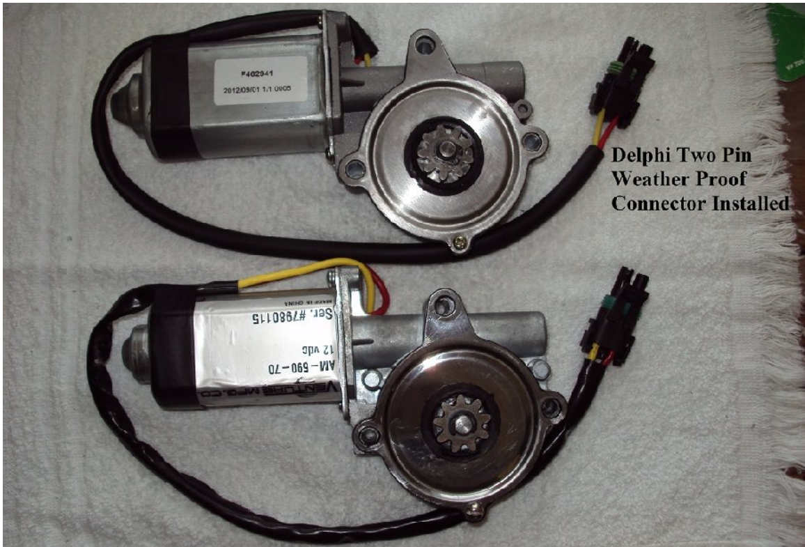
Delphi Two Pin Weather Proof Connector Installed